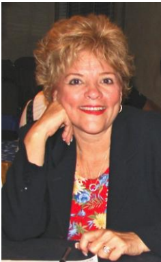
8/23/1947 – 8/7/2009

10% off purchases $25+ 20% off purchases $50+